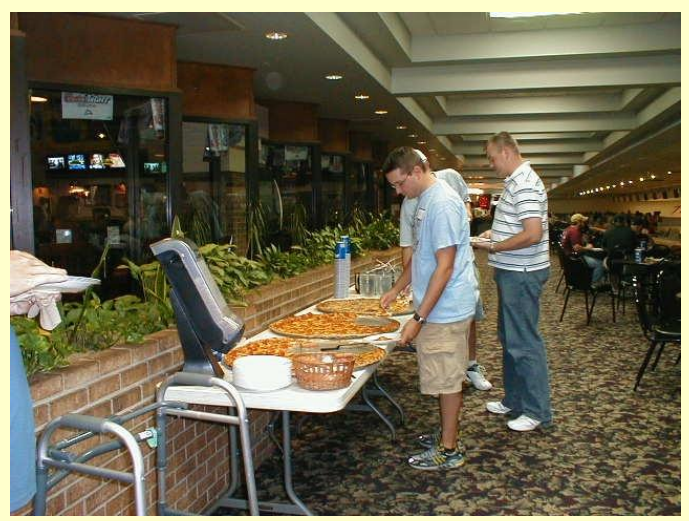
Last year's bowling/pizza evening

The Sport Management Student Association is hosting this event as a kick off to the 2008-2009 school year. Come out to bowl a few frames, see which of your classmates look groovy in bowling shoes and enjoy some free pizza and soda from AJ's Sports Grill. $6.00 is all you'll need to get shoes and bowl all night.