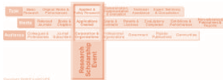
Figure 3. UniSCOPE Model of Research Scholarship

The “mix and match” features of the UniSCOPE model are also apparent here. For example, the results of basic research can be published in refereed journals for colleagues and professionals. That same information can also be used for creating applications through grants and contracts for corporations, communities, or government agencies. Many other combinations are also possible. We believe this model has the essential concepts for developing a comprehensive, fair, and equitable approach to recognizing and rewarding the full range of research scholarship.