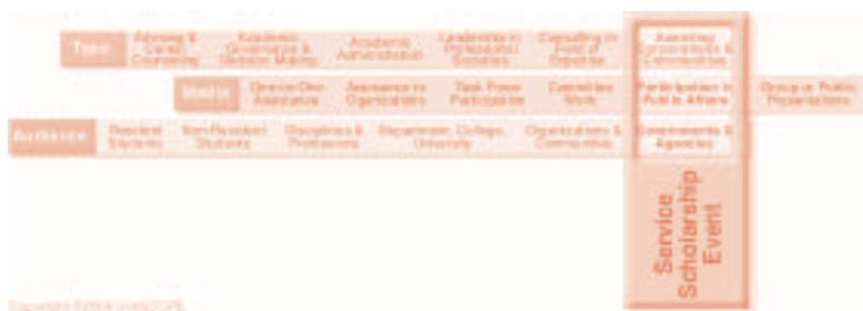
Figure 4. UniSCOPE Model of Service Scholarship

The types of service scholarship may be manifest in student advising, academic governance and decision making, academic administration, leadership in professional societies, assisting corporations and communities, and consulting based on the scholarly expertise of the faculty member. We consider the types of service scholarship to include advising, academic governance and administration, leadership in professional associations and societies,