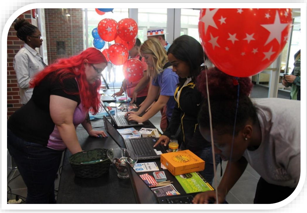
Students registering to vote via TurboVote at National Voter Registration Day.