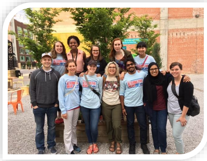
ASB Students Participating in service-learning reorientation project in downtown Wichita