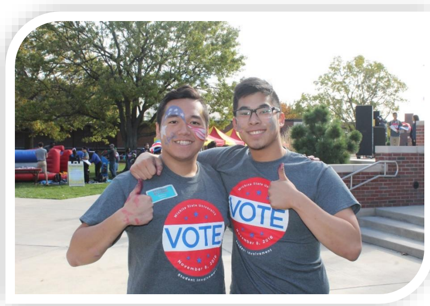
Students at the Election Day Carnival, Joy of Voting Grant Event