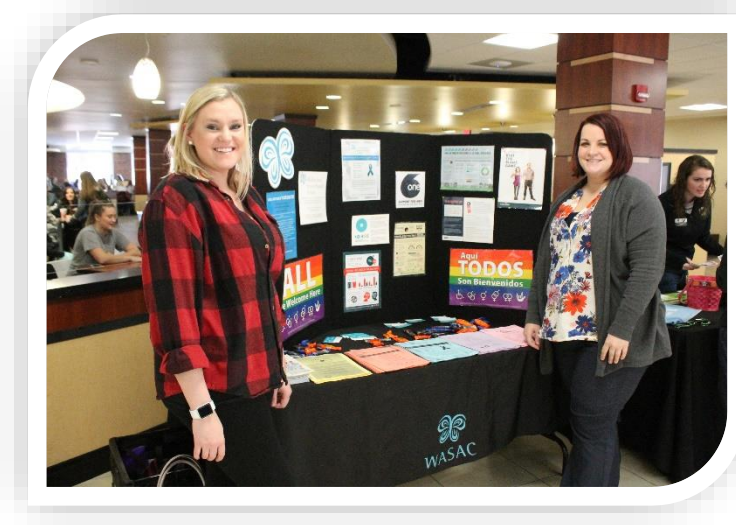
Community Partners at our annual Volunteer Fair in the Rhatigan Student Center.

Service-Learning (S-L) at Wichita State University is an experiential learning method that integrates community service with instruction and reflection to increase student civic mindedness and build community capacity.