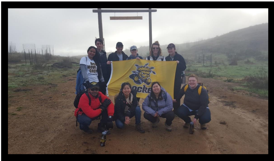
Students volunteering as part of the Alternative Spring Break class, completing trail maintenance.