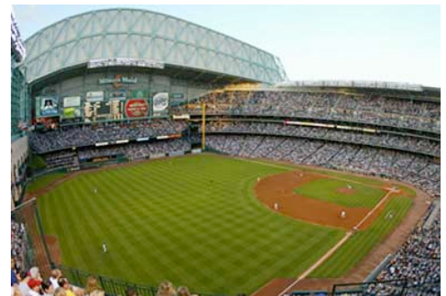
Minute Maid Park, home of the Astros, will be one of the sites sport administration students visit next month.