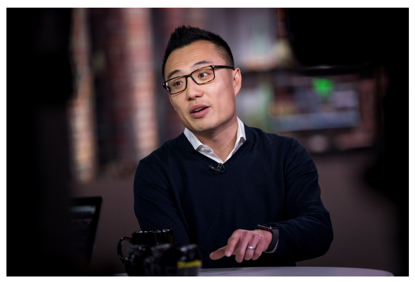
Tony Xu

The three co-founders of San Francisco-based <u>DoorDash Inc.</u> each amassed fortunes of <u>$2.5</u> <u>billion</u> or more. Jitse Groen, who started European rival Just Eat Takeaway.com, racked up a $1.5 billion fortune.