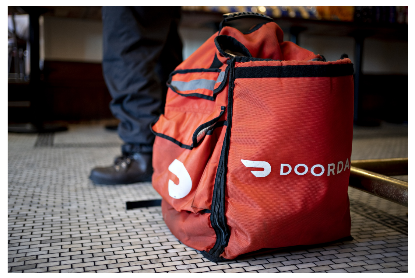
A DoorDash delivery bag at restaurant in Washington, D.C.