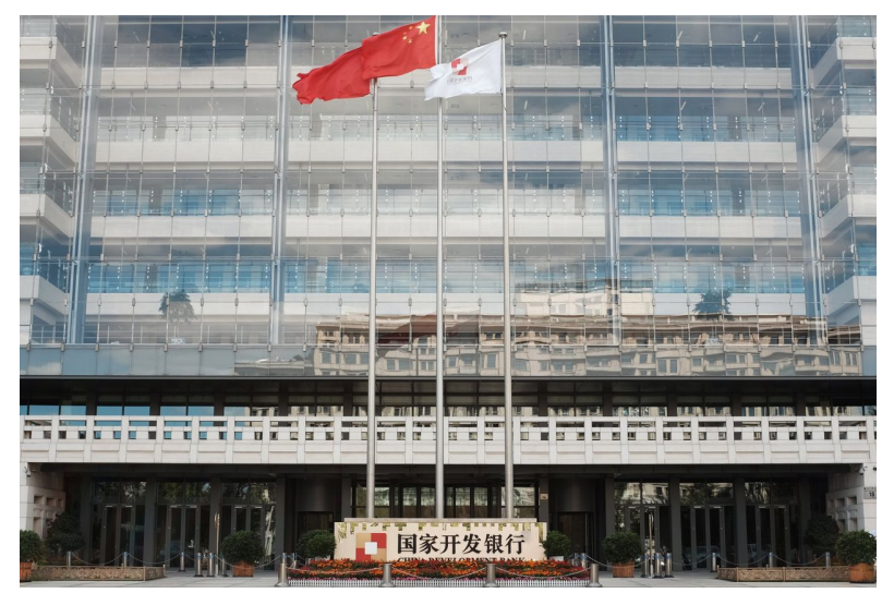
A Chinese flag flutters at the Beijing headquarters of China Development Bank, which has made a $30 billion credit line available for Huawei's customers.

Bank and official data indicate these banks were lending to the company's clients in developing economies at some 3% in at least Huawei's first decade abroad, around half of China's five-year benchmark rate in since 2004.