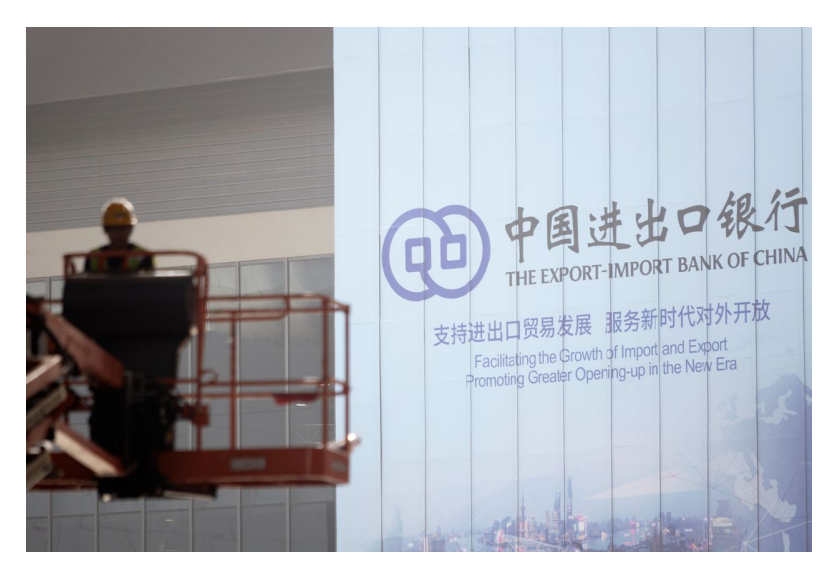
A worker operates near a sign for the Export-Import Bank of China, which has made a credit line available for Huawei customers.

China's foreign ministry said in a statement that Huawei is a private company "like many others in China" whose achievements "are inseparable from a good policy environment."