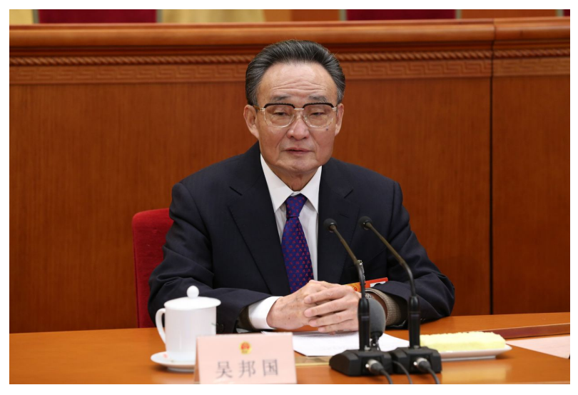
Wu Bangguo—who as a Chinese vice premier oversaw state-owned companies—assembled a team of auditors after tax breaks for Huawei led to accusations around 1998 that it was evading taxes. Huawei was cleared.