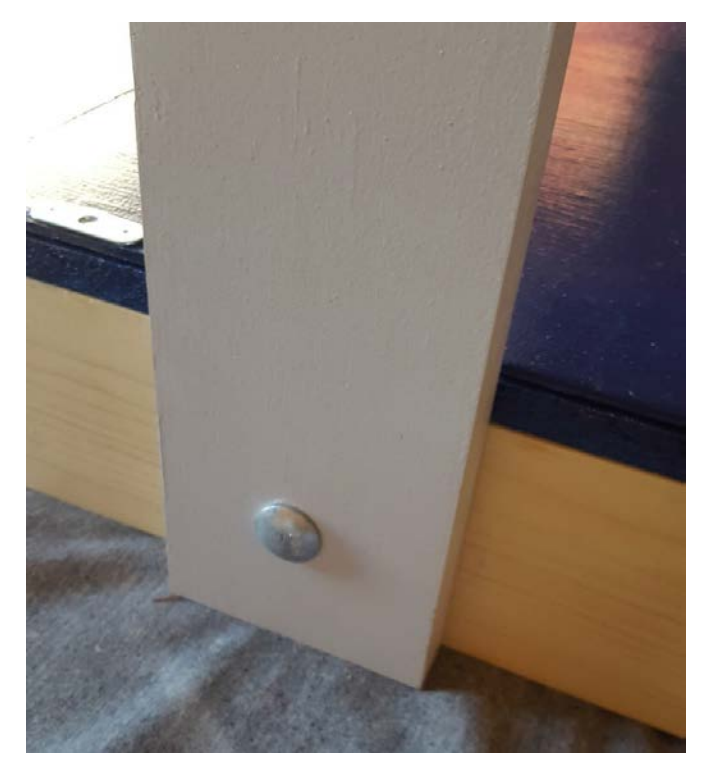
Figure 3 - Carriage Bolt