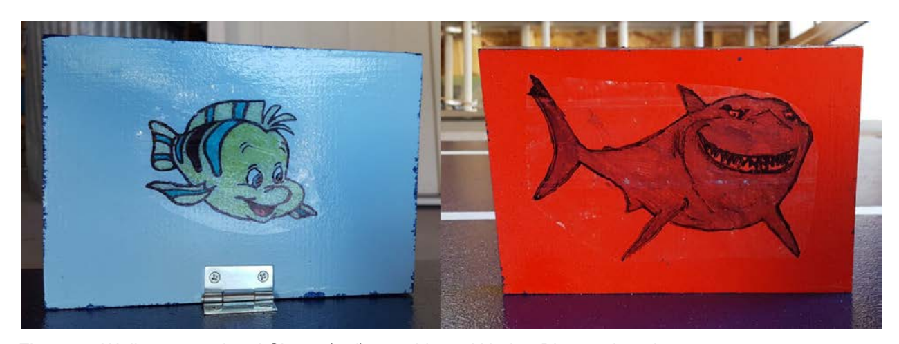
Figure 1 - Walls spray painted Cherry (red) one side and Harbor Blue on the other