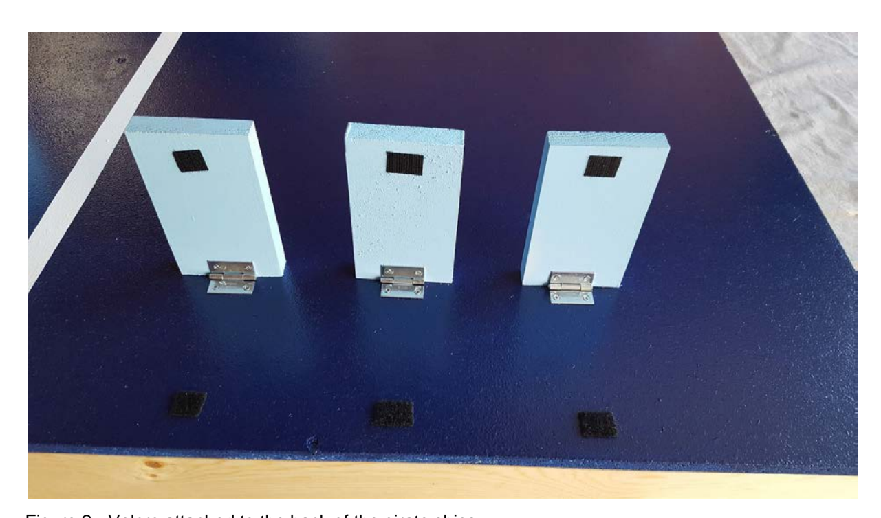
Figure 2 - Velcro attached to the back of the pirate ships.