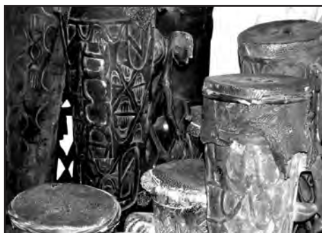
Several drums are part of the Asmat collection. The handle of the center drum in this photo is crafted in the likeness of a man.

More than two years after its arrival at Wichita State, a selection from the Downing Collection of Asmat Art soon will be on exhibition.