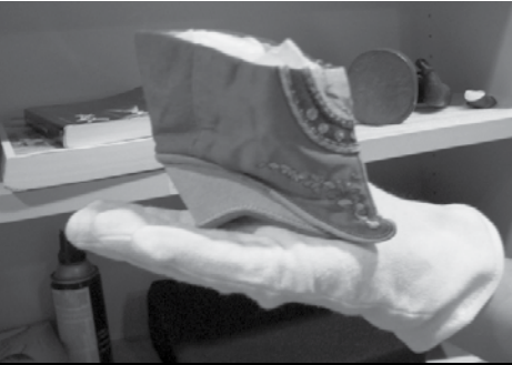
THIS SILVER LOTUS SHOE FEATURES EMBROIDERY MOST LIKELY MADE BY ITS WEARER.