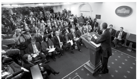
PRESIDENT BARACK OBAMA HOLDS A PRESS CONFERENCE IN THE JAMES S. BRADY PRESS BRIEFING ROOM OF THE WHITE HOUSE DEC. 19, 2014.