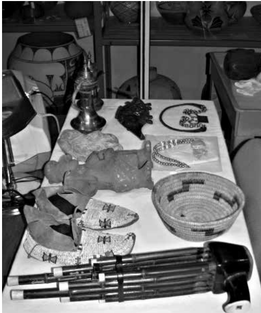
SEVERAL PIECES TO BE USED IN JORDAN ADAMS' THESIS PROJECT WAIT TO BE CLEANED OR REPAIRED.

From there, the Lowell D. Holmes Museum of Anthropology grew exponentially in the scope and breadth of its collections, which today include approximately 7,000 pieces. Now located in Neff Hall, the museum occupies approximately 3,000 square feet as a designated space, but pieces from the collections appear throughout the building.