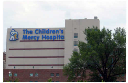
Children's Mercy Hospital in Kansas City, MO