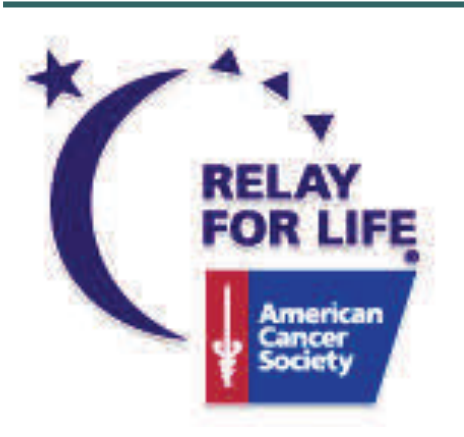
Friday, July 20, 2012 6:00 pm Collegiate High School Track

Friday, April 27, 2012 6:00 - 8:00 pm Old Town Square - Warren Plaza Wichita, KS