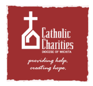
Current Job Vacancies

For more information on Holiday Resort, visit <a href="http://midwesthealth.ppi.net/residence/HolidayResortofSalina/default.aspx">http://midwesthealth.ppi.net/residence/HolidayResortofSalina/default.aspx</a>.