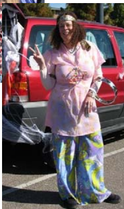
↑ Trunk-or-Treat ← SOSW Picnic