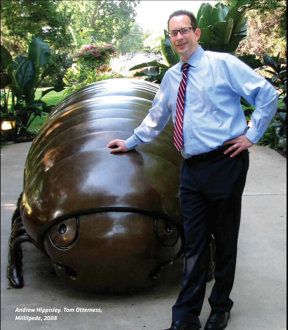
Tom Otterness, Millipede, 2008