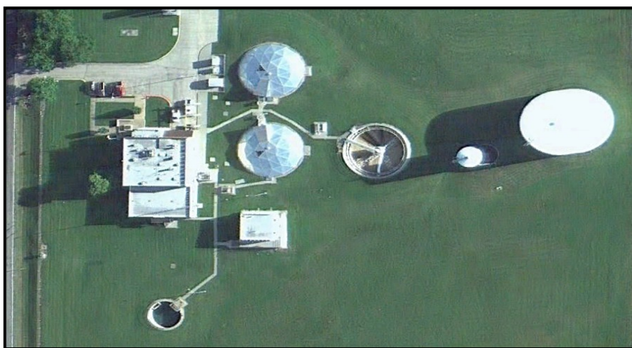
Winfield Water Facilities

In the future, the city of Winfield plans to apply the Energy Management System approach to other departments and programs.