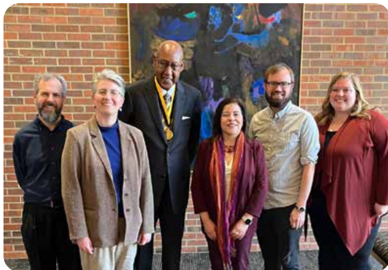
Department members with Judge Sturns

The department is proud to celebrate Judge Louis E. Sturns , who was inducted into the Fairmount College of Liberal Arts and Sciences Hall of Fame in February 2023. Honorees are chosen because they exemplify the merits and advantages of a liberal arts and sciences education. Louis E. Sturns is a 1971 alumnus with a bachelor's degree in political science. He has served as the first African American Criminal District Court Judge in Tarrant County, Texas; the first African American on the Texas Court of Criminal Appeals, the state's highest court for criminal cases; and the first African American president of the Tarrant County Bar Association.