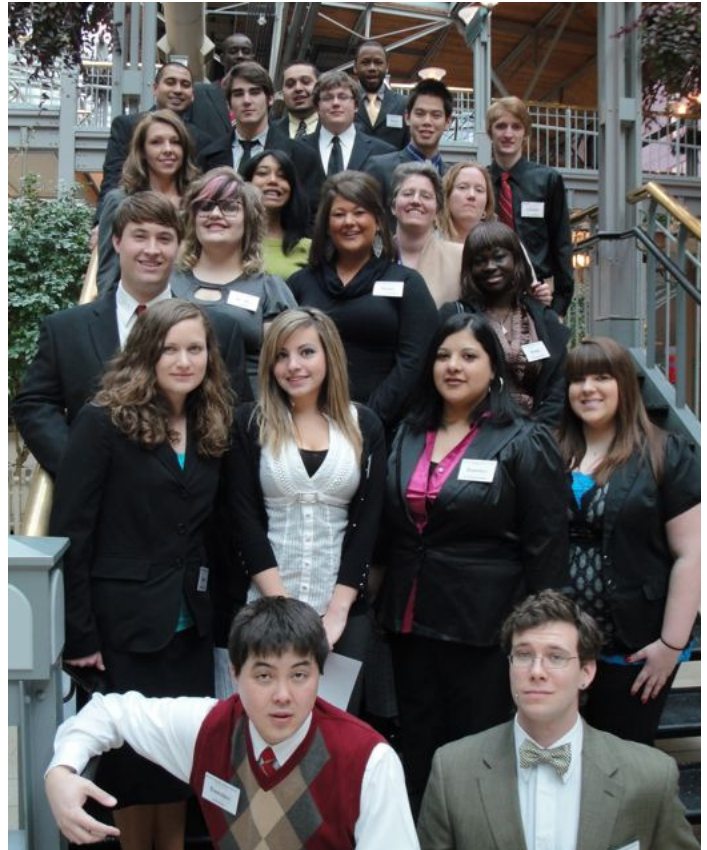
2010 Wichita State Model UN Team at Union Station in St. Louis.