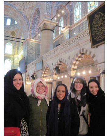
Sultanahmet / Blue Mosque