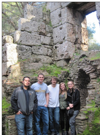
Roman Ruins in Phalesis