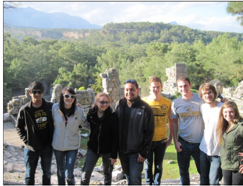
Roman Ruins in Phalesis