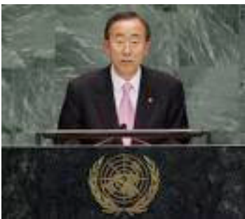
Secretary General Ban Ki Moon

On the opening day of the conference, delegates gathered in front of the United Nations building in New York to pass through security for the opening ceremony. It was not until we were actually seated in the General Assembly Great Hall that we learned that Secretary General Ban Ki Moon and Dr. Srgjan Kerim, President of the General Assembly and Ambassador from Macedonia, would be the keynote speakers for the ceremony. Both spoke of the importance of the next generation, the students gathered in the Great Hall, for addressing the many crucial issues facing the world today. Both were greeted with standing ovations, which they wryly noted was unusual, but deeply appreciated.