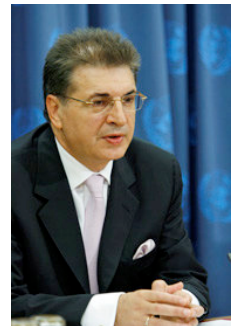
GA President Srgjan Kerim

On the opening day of the conference, delegates gathered in front of the United Nations building in New York to pass through security for the opening ceremony. It was not until we were actually seated in the General Assembly Great Hall that we learned that Secretary General Ban Ki Moon and Dr. Srgjan Kerim, President of the General Assembly and Ambassador from Macedonia, would be the keynote speakers for the ceremony. Both spoke of the importance of the next generation, the students gathered in the Great Hall, for addressing the many crucial issues facing the world today. Both were greeted with standing ovations, which they wryly noted was unusual, but deeply appreciated.