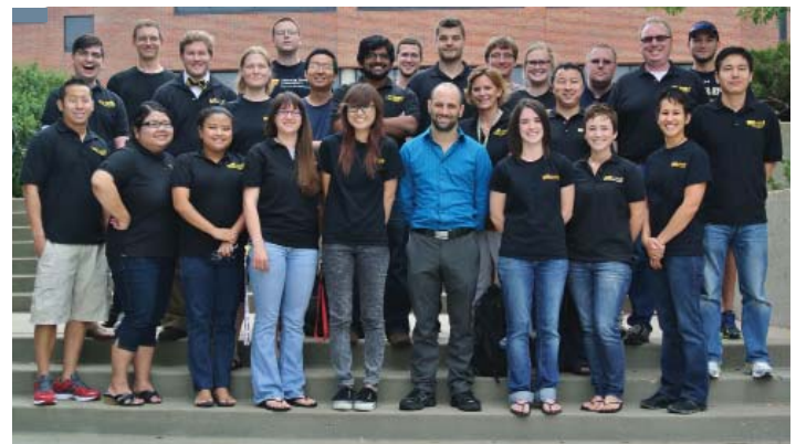
WSU's HFES Student Chapter

The group is actively involved with the university and local community throughout the year. Recently the group has added members from the Industrial Engineering department as well as undergraduates. In total, the group has 36 members across students and faculty.