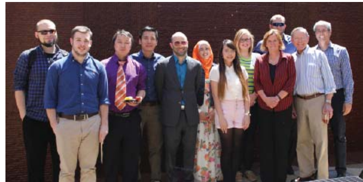
Undergraduate student grant winners with thier faculty mentors

Congratulations to all of our student award winners for the 2013-2014 academic school year!