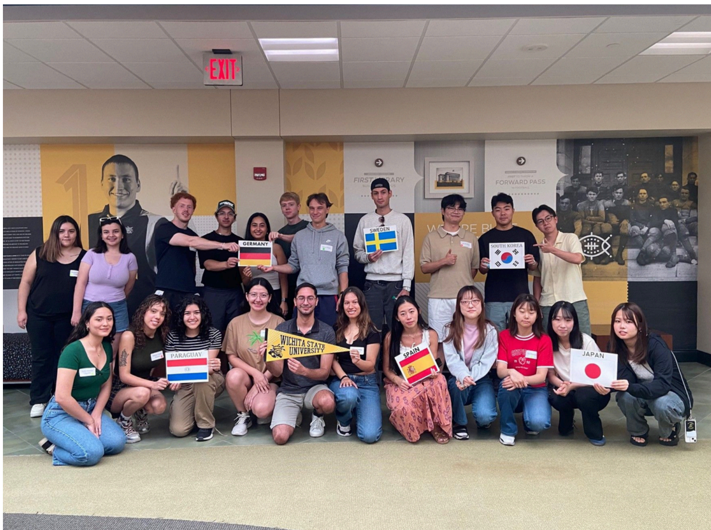
Previous Short-Term Program students at Wichita State University