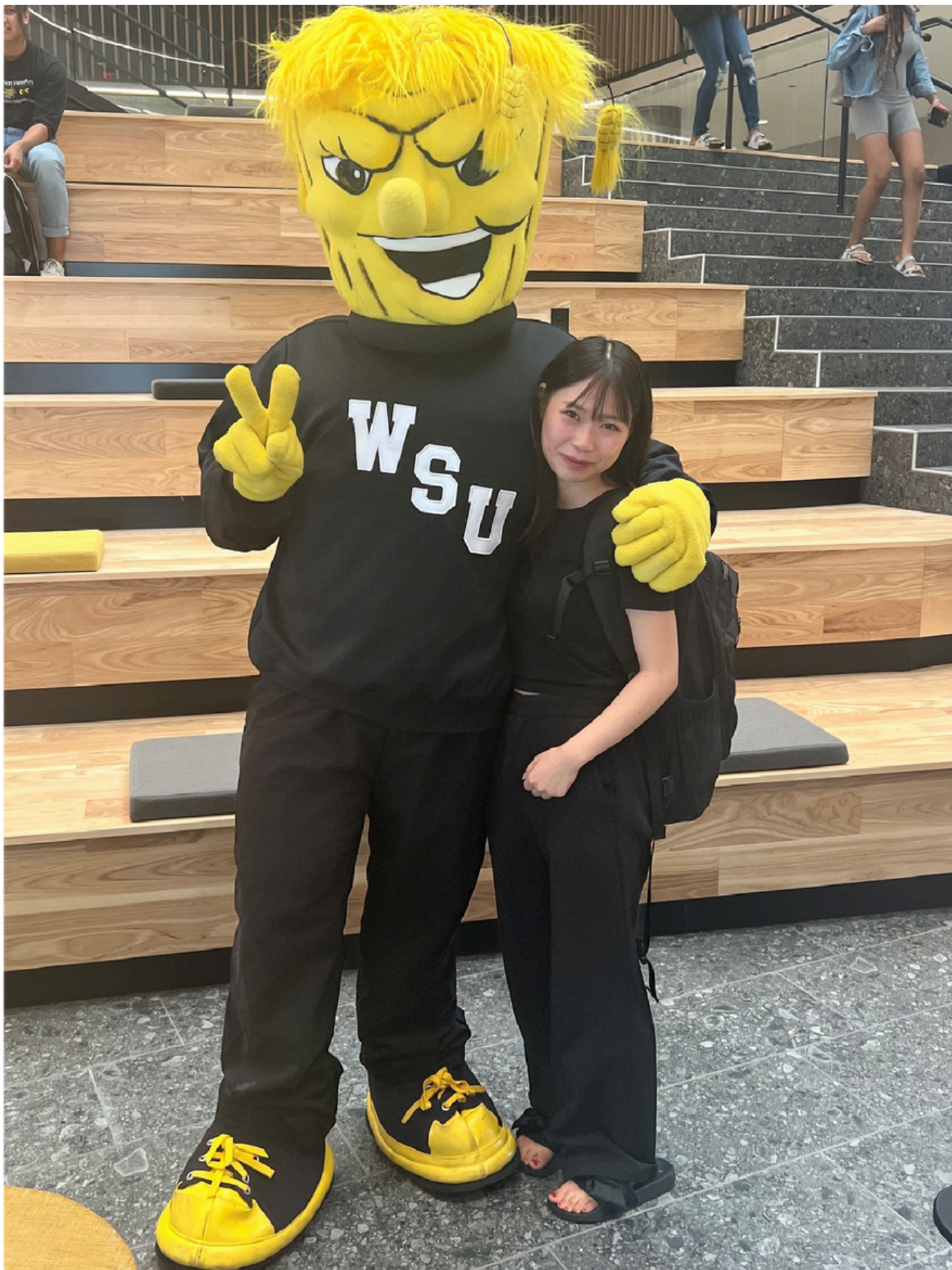
Previous Short-Term Program students at Wichita State University