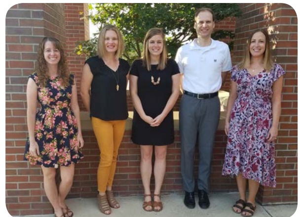
Several admissions team members who spent hours working on the CRM Recruit upgrade