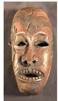
2023.1.5 from Indonesia