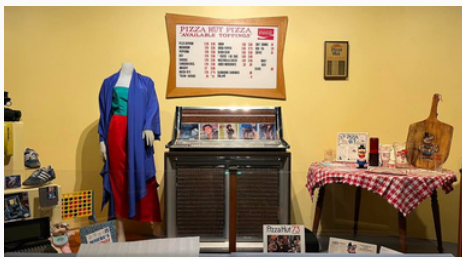
Smoky Hill Museum in Salina