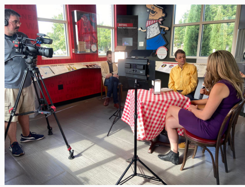
Filming Good Day Kansas on KSN