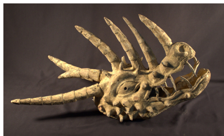
2023.1.4 from the Bamana people of Mali