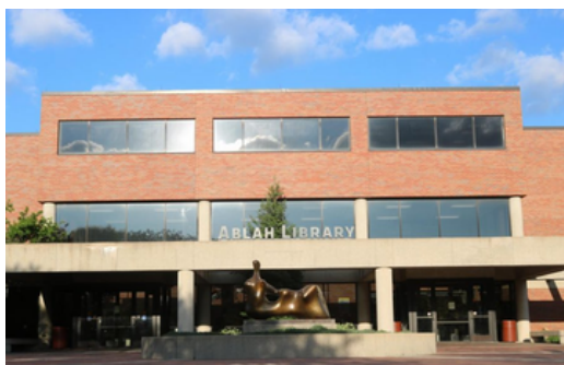
Future home of the Anthropology Museum