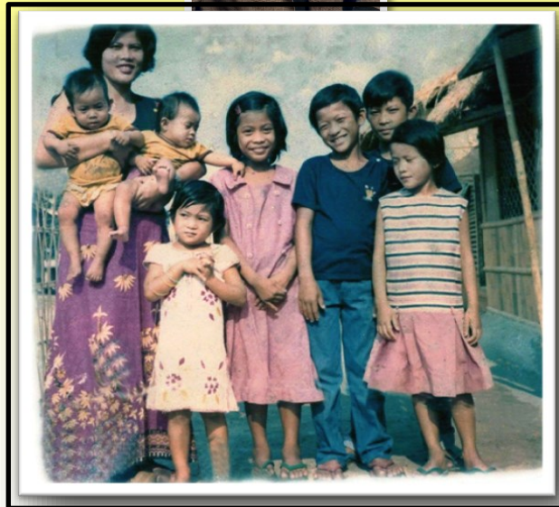
Refugee camp in Thailand