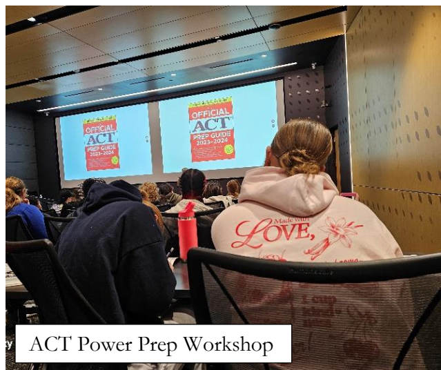
ACT Power Prep Workshop

What is changing with the new ACT? As many students may or may not know, tremendous changes are happening in April 2025. The new and updated ACT will be available to all students that are taking the test online. The online test will have more flexibility including, a shorter test, and more time allotted for answers to each question. There will also be an option to skip the science and writing sections. However, the composite score will comprise the average of English, math, and reading scores. Science will be included as a separate score for students choosing to take the science section. By September 2025, all students whether testing online or on paper will be able to experience the benefits of the updated ACT. By Spring 2026, all schools and districts will have officially accepted these options. For more information on the ACT, please visit their website: www.act.org .