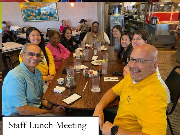
Staff Lunch Meeting