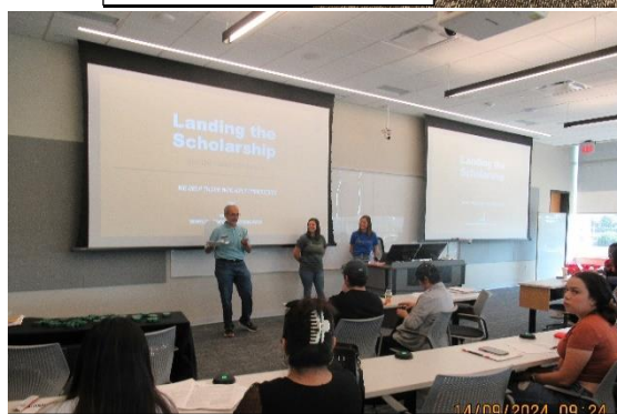
Senior Financial Literacy Workshop