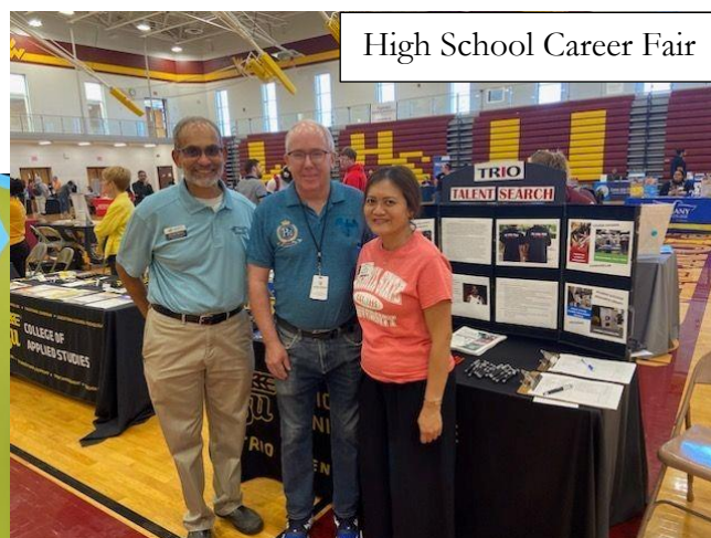
High School Career Fair