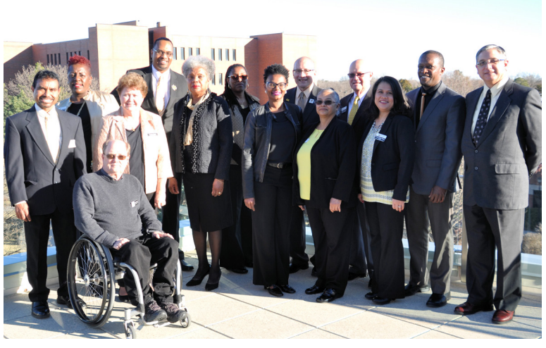
OSP Directors gather before the banquet.

Student Affairs. Her efforts to provide promotional and other resources are priceless because the programs, due to federal regulations, are restricted in purchasing certain items.