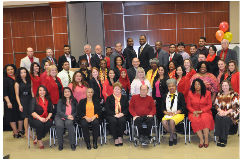
OSP Staff Picture, TRIO Day 2016