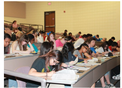
City-wide ACT Prep Work Shop at North High School