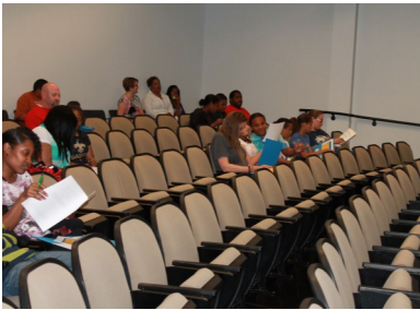
College Jump Start