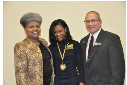
National TRIO Day