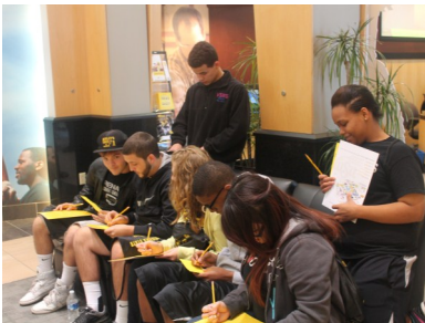
Wichita State University Campus Visit