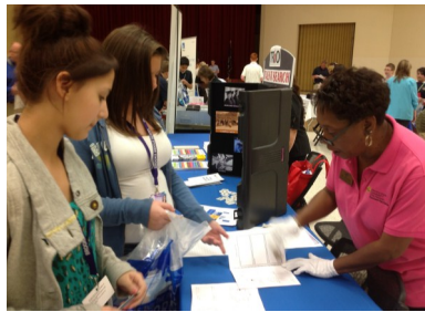
Career Fair at Century II