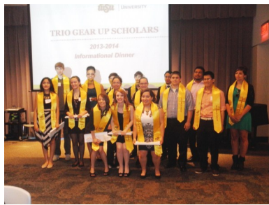
TRIO-GEARUP Scholars Dinner