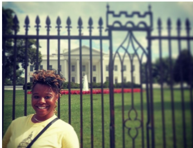
National Student Leadership Council