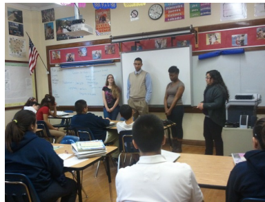
College Student Panel at Marshall Middle School