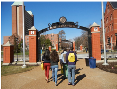
Missouri Spring Break Campus Visit Trip