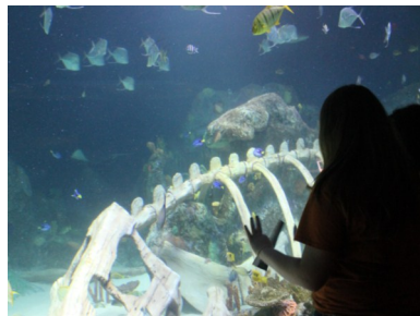
Summer Enrichment Program SEA LIFE Aquarium