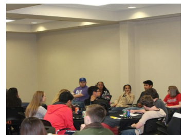
ACT Prep Workshop