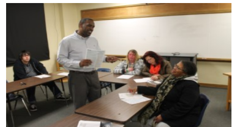
FASFA Finish Line