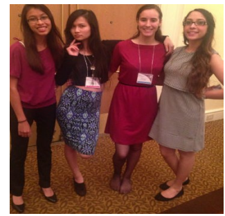
MAEOPP Girls in STEM Pre-College Student Leadership Conference