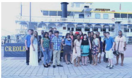
Summer Enrichment Program Session I: New Orleans College Road Trip