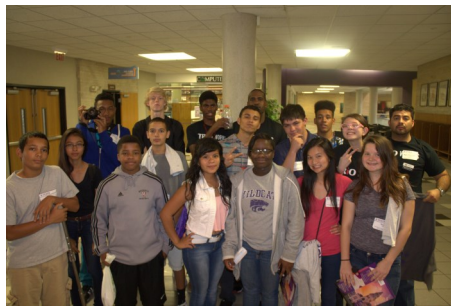
K-State Campus Visit