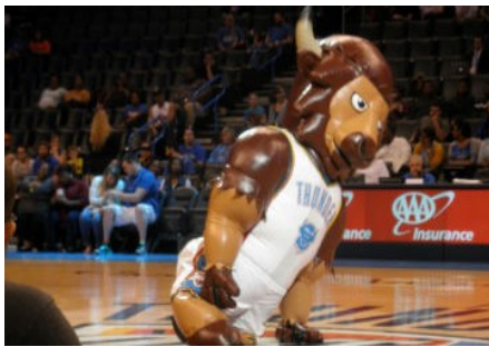
OKC Spring Break Trip