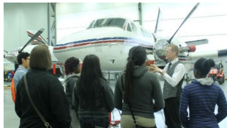
Cowley/WATC Campus Visit