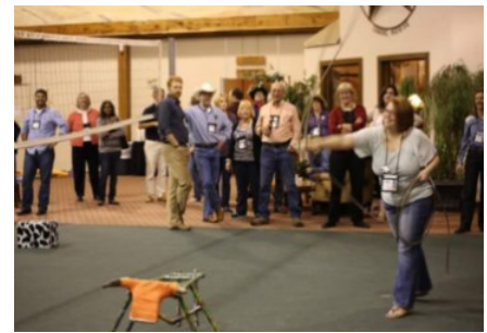
KASFAA Financial Aid Workshop