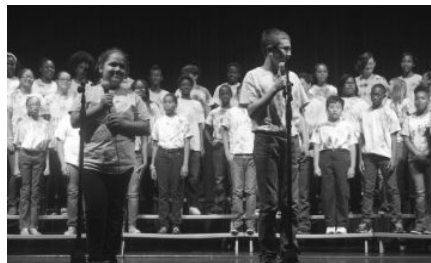
Summer Enrichment Program Session II: Talent Showcase