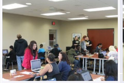
KASFAA Financial Aid Workshop at WSU