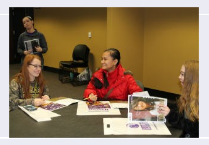
Butler CCC Campus Visit