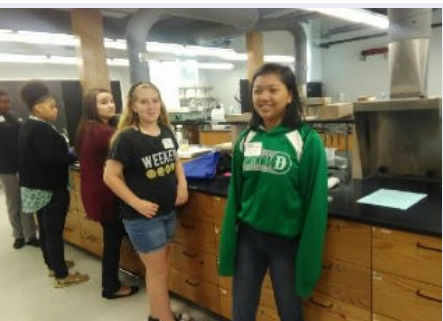
Expanding Your Horizons Workshop