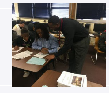
West High Career Workshop