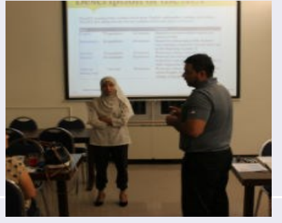
College Jump Start