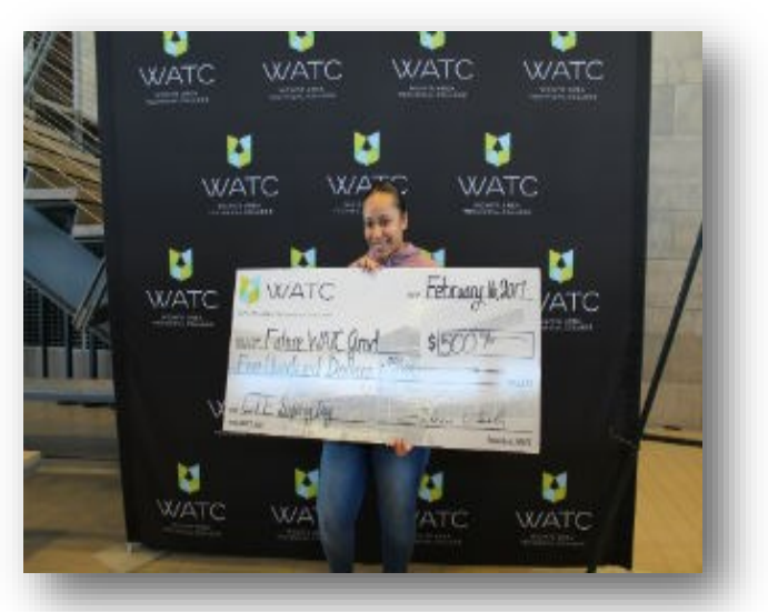
WATC Signing Day Scholarship Giveaway

A computer lab was available for program students to complete online applications and to complete the FAFSA. Program counselors reviewed applications and students were advised of admission application fee waivers and grants for TRIO participants available at many colleges and universities. Workshops were offered throughout the year providing students information on financial literacy, scholarships and other related topics. The program collaborated with Kansas Kids at GEAR UP to hold a half day-long financial aid workshop called FAFSA Finish Line. The program also participated in the Wichita Area Technical College (WATC) Signing Day Scholarship Giveaway where graduating high school seniors intending to pursue a career and technical education (CTE) at the college level are eligible for $500 to $1000 scholarships.