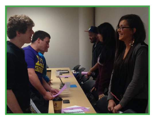
McNair students shared information about themselves during the October Faculty-Led Seminar "Personal Statement Writing."