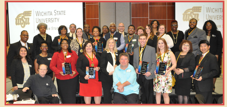
During the 2017 National TRIO Day (NTD) celebration, each special program at WSU honored a distinguished alumni.