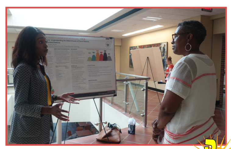
Student researchers gave both oral and poster presentations during the Closing Symposium.