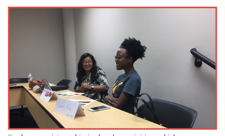
Students participated in ice breaker activities to kick off orientation activities August 18, 2017.