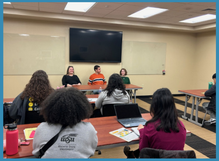
Students had the opportunity to listen to McNair Alumni talk about their experiences in graduate school and with the graduate school application process.