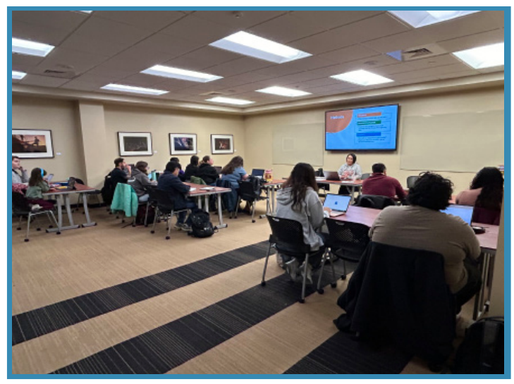
14 students attended the January seminar covering "methodology and data collection" and "the back-up plan".