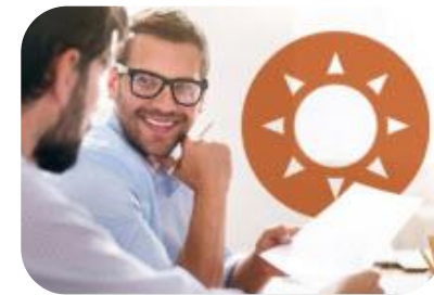
Leadership and Management