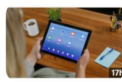
Microsoft Learning and Tools