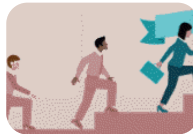
NACE 2021 Competencies