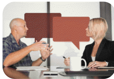
HR Frameworks (i.e. Korn Ferry)