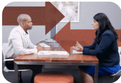
Return to Work