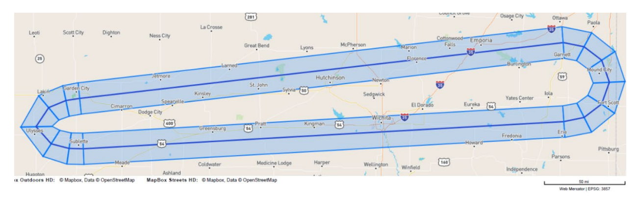
Figure 1: Kansas Transportation Corridor

NIAR WERX at WSU (National Institute for Aviation Research - Wichita State University) in conjunction with the Kansas Department of Transportation (KDOT) is engaged in a program to establish a supersonic flight test corridor known as the Kansas Transportation Corridor (KTC) shown in Figure 1.